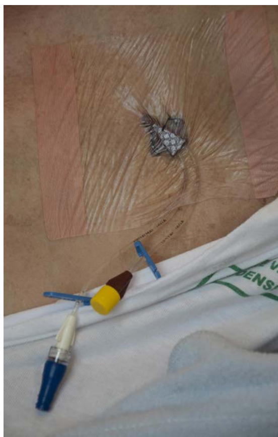
Central venous catheter in a haematology patient.

The outbreak subsided after multiple interventions aimed at improving catheter hygiene. In itself, this is not proof that the outbreak was catheter-related. However, the absence of other issues during the audit suggests that it may have been catheter-related. Furthermore, the simultaneous decline in CoNS isolated from BCs indicates that the measures taken to improve catheter hy-