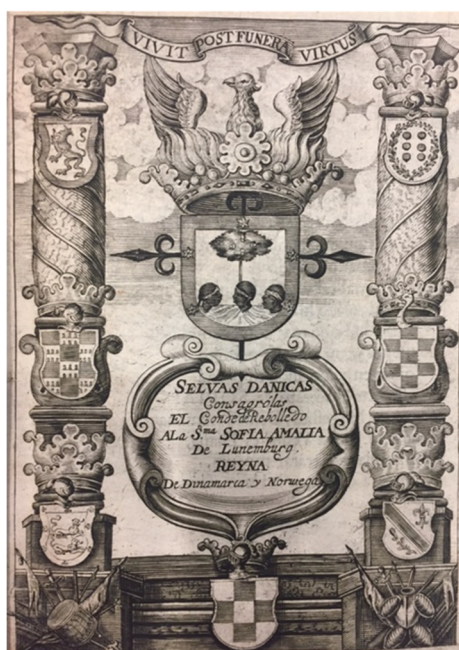
Fig. 2. Title page of the 1st edition.