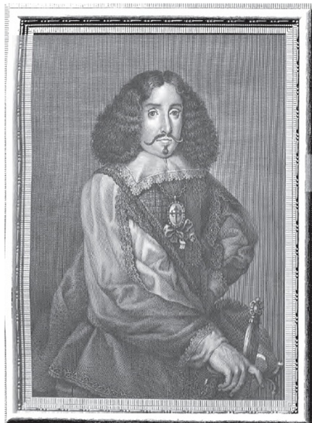
Fig. 1. Anonymous artist: Bernardino de Rebolledo. Retratos de españoles ilustres (1791).

However, even though Rebolledo's mediocre Culteranist silvas 4 may impress literary scholars just about as little as his schematic and repetitive historiographical narrative (neither characterized by antiquarian erudition nor by the elegant flow of the narration) 5 will excite scholars of Renaissance historiography, the poem is in fact a highly interesting cultural historical document. It can be seen as a Catholic reappropriation of Danish history vis-à-vis Johannes Meursius' Historia Danica (1630) and Johannes Pontanus' Rerum Danicarum Historia (1631), both commissioned by Christian IV as part of his ambitious cultural political programme. 6